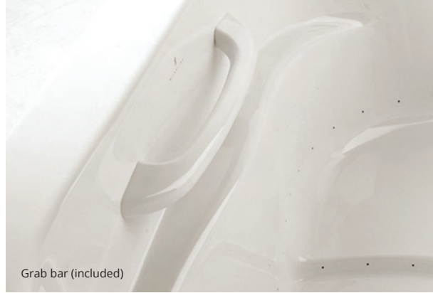
Grab bar (included)