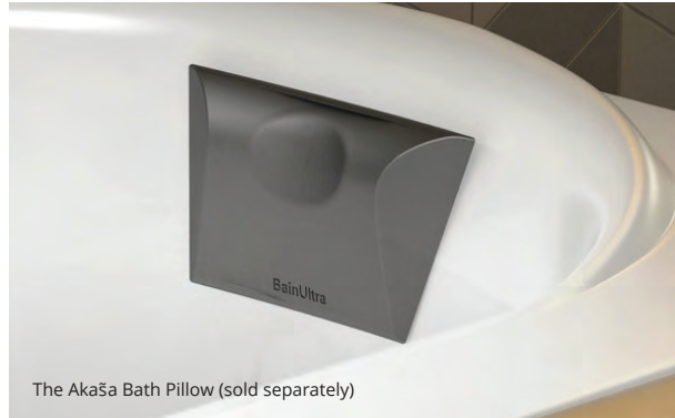
The Akaša Bath Pillow (sold separately)