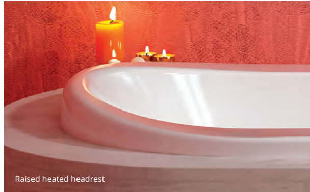
Raised heated headrest