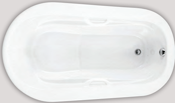
AMMA OVAL 6638