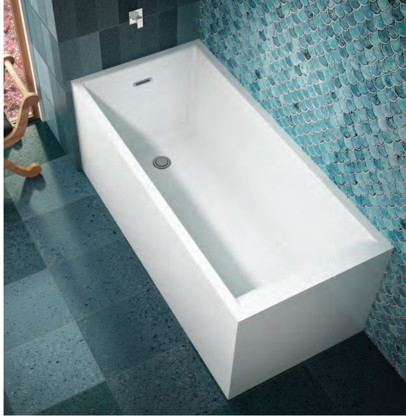
NOKORI 6429 (FREESTANDING)